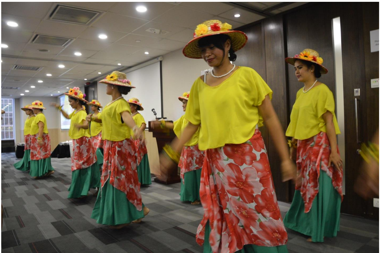
Cultural dance number performed by OFWs to entertain participants.