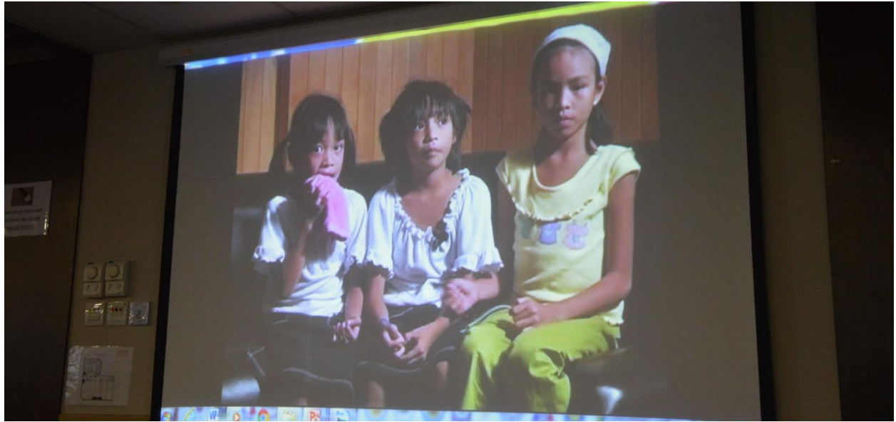
Video-showing of Bayani Ba Ang Nanay Ko left almost all in the audience in tears as most of the participants are mothers and have experience the social cost of migration of being away from their children, family and loved ones.